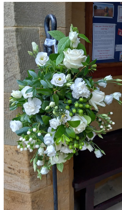
Pole in porch way