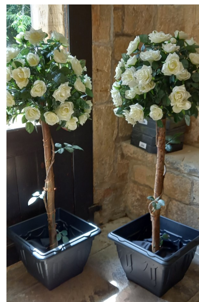
2 rose trees