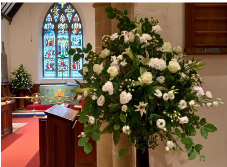
pedestal in foreground just behind the lectern and one at the altar