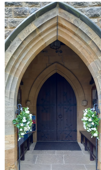
Both poles in porch way