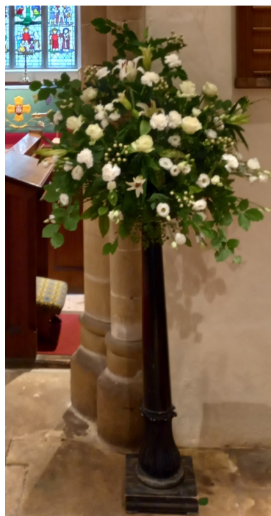
Pedestal at the lectern