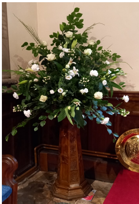
Pedestal arrangement at the altar