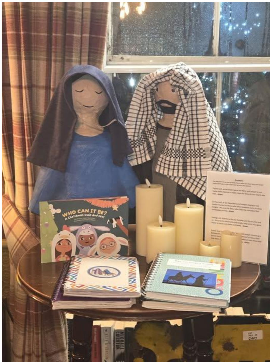
Mary and Joseph out and about in the community during Advent