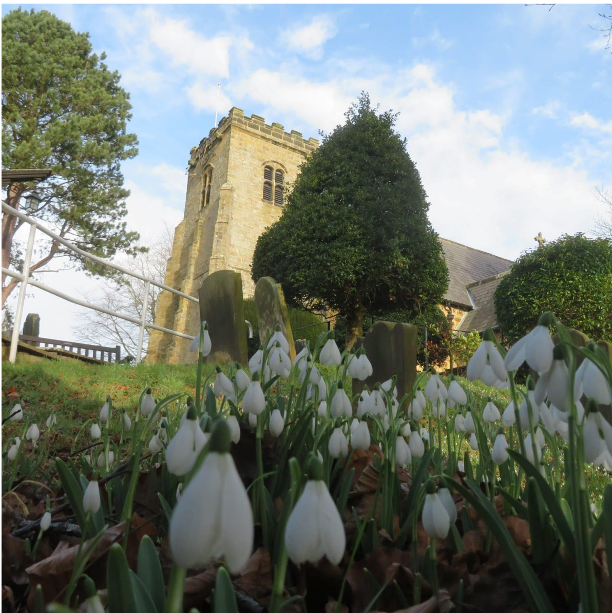
Spring in the Churchyard