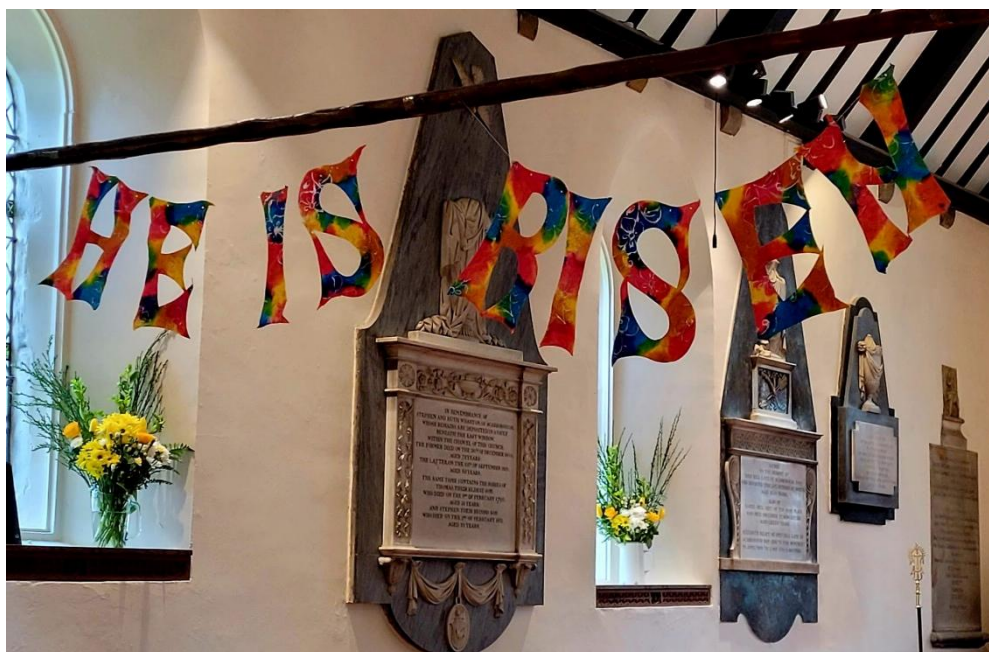
Easter in the Church