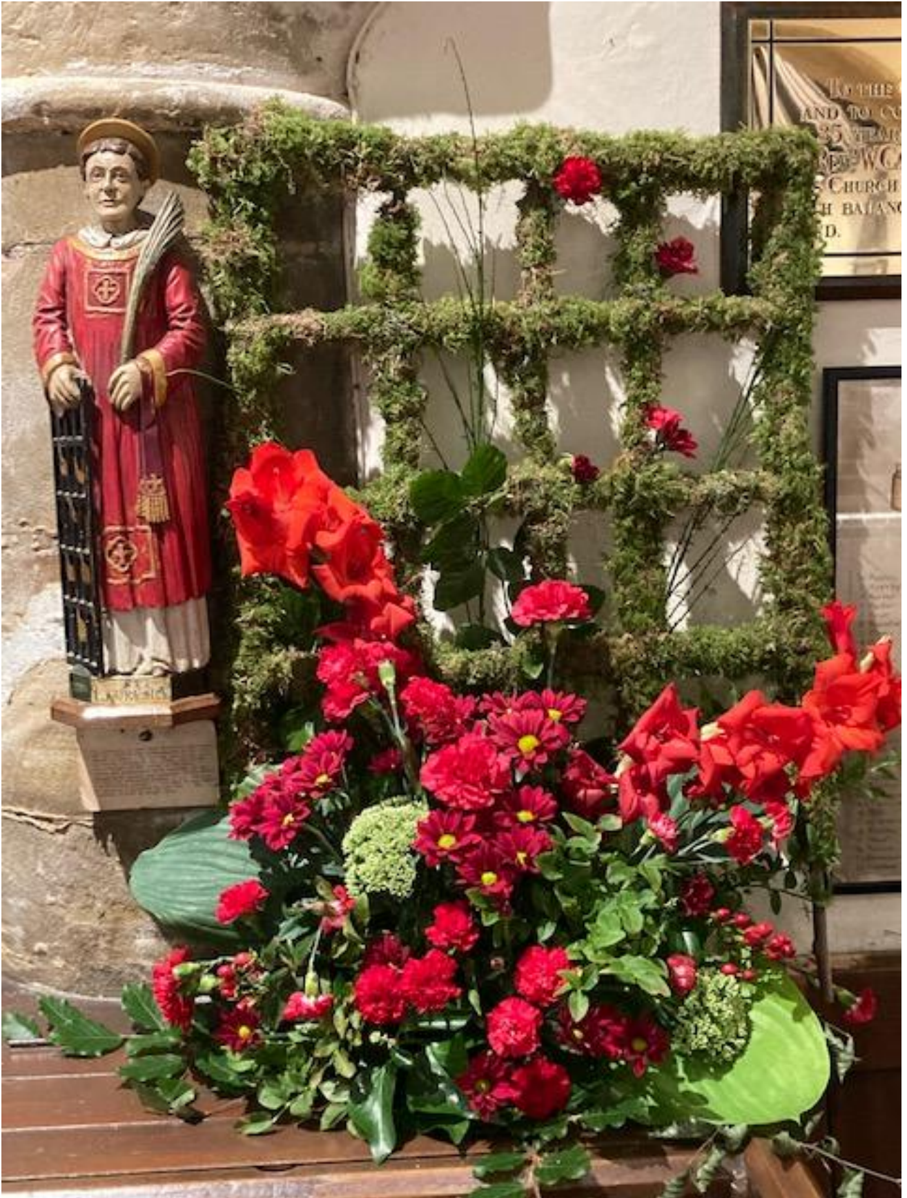
The Church on St Lawrence's Day