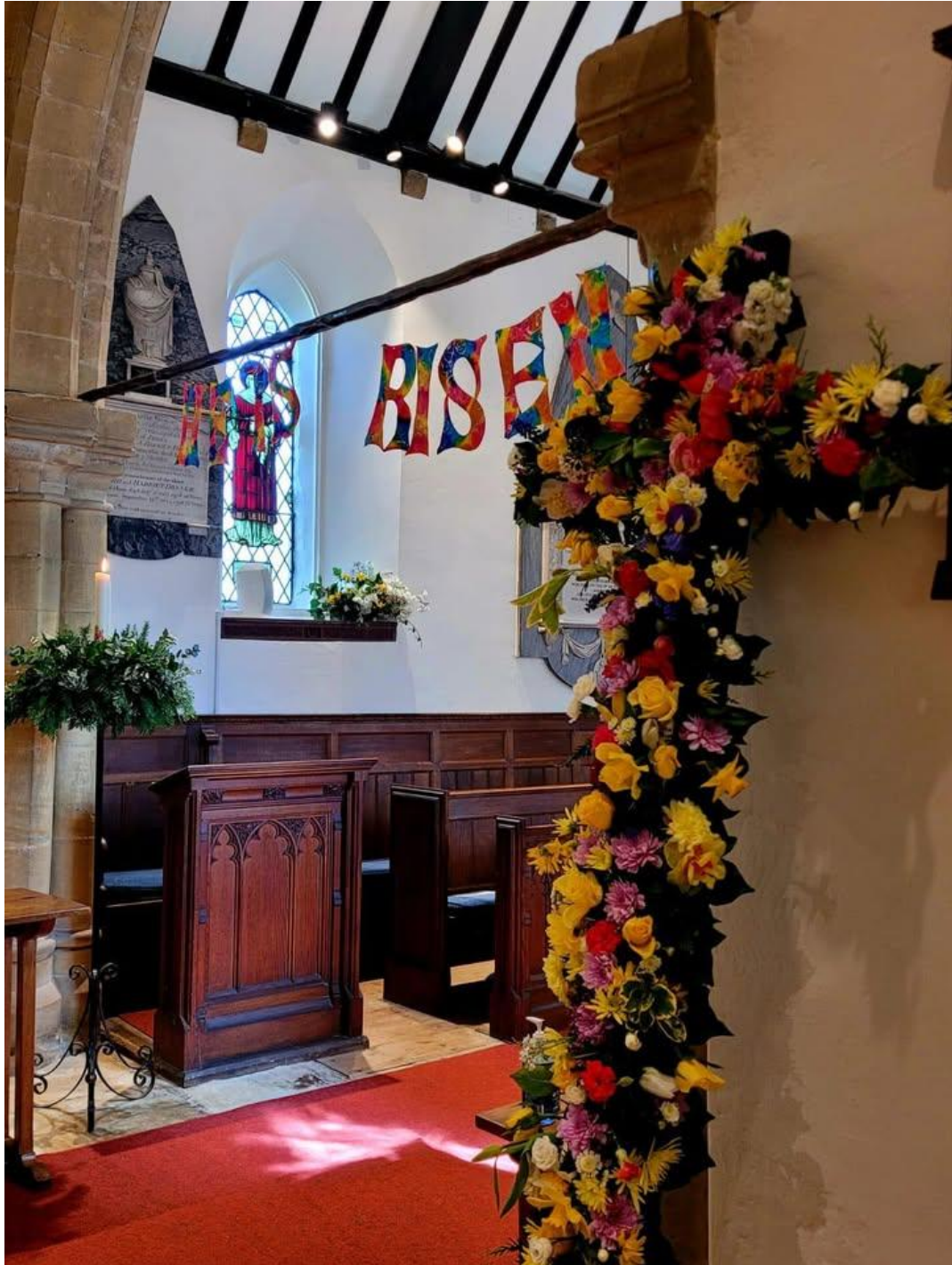
Easter in the Church