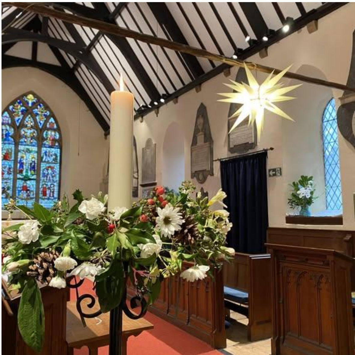
Epiphany Sunday in the Church